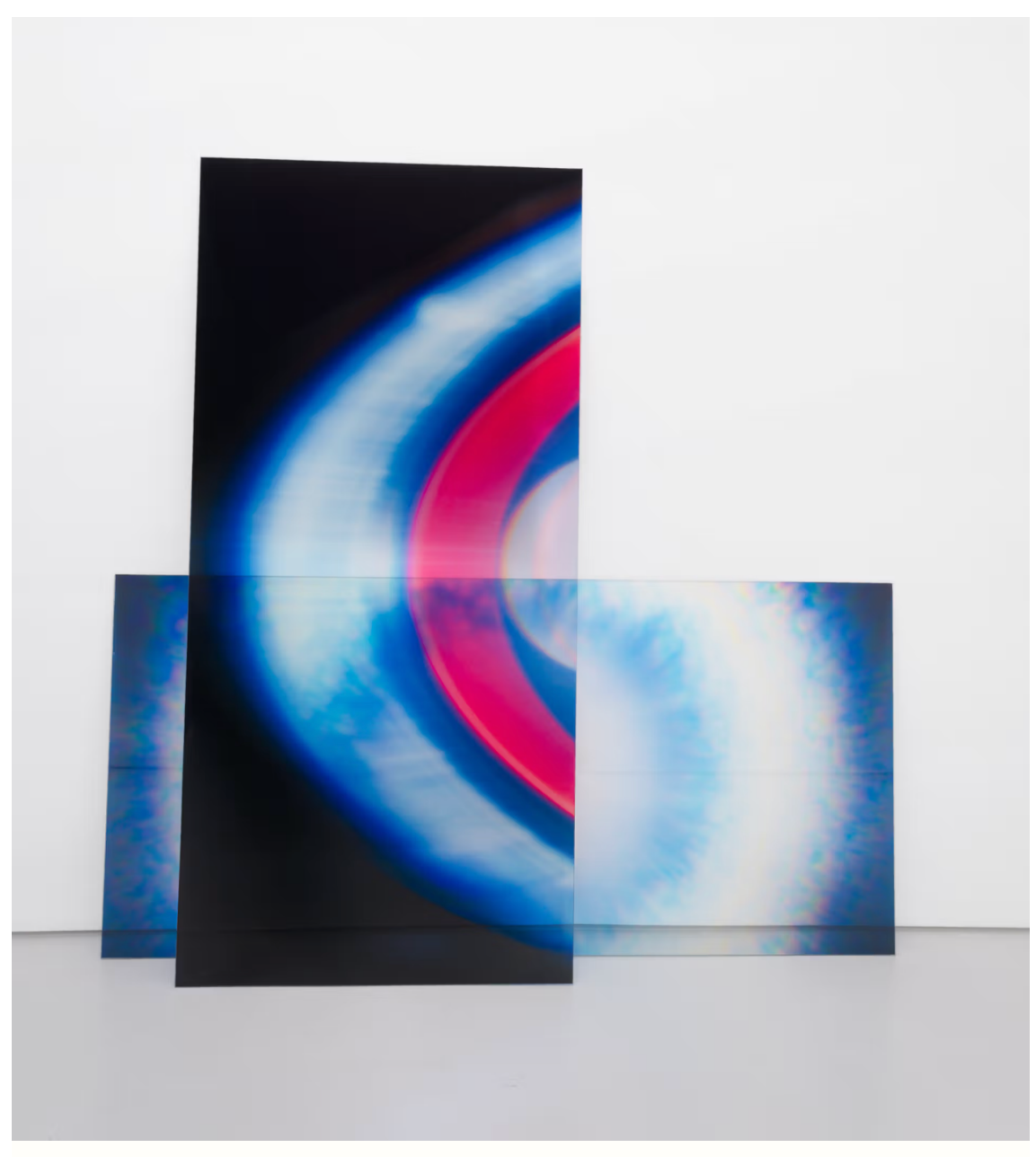
Vue de l'exposition « Angelica Mesiti : Acoustic Light » à la Galerie Allen, Paris.