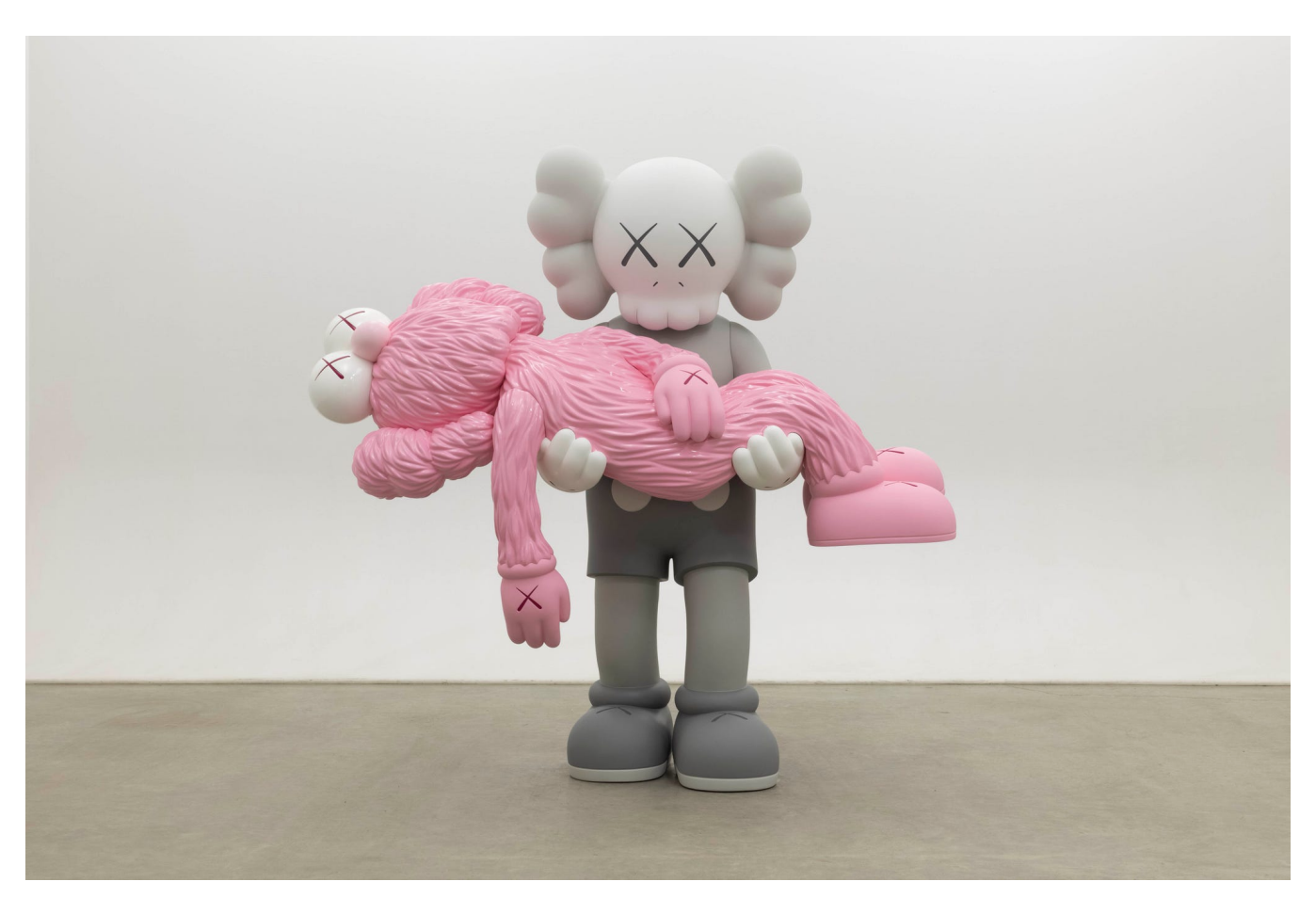
Crystal Bridges Museum of American Art KAWS Gone (2020)