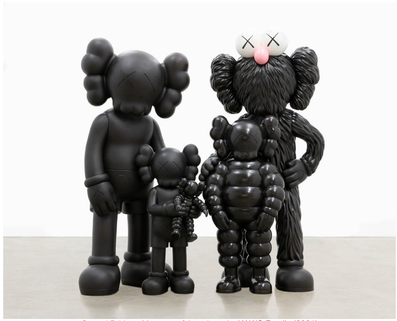
Crystal Bridges Museum of American Art KAWS Family (2021)

It was curated by Julian Cox and it's more of a survey than anything. We've had a couple of surveys in the last few years and, for this one, we wanted to focus on [...] the community I've built in the body of work I've created. The title of the show comes from the title of a sculpture within the show – this is usual for one of my exhibitions. Family is a sculpture of four figures and an extra little one – that was the guiding light.