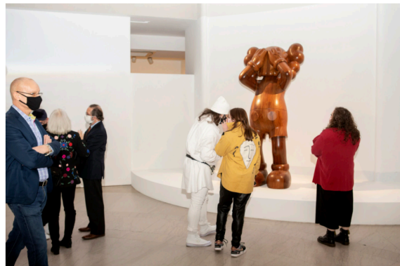
Attendees in front of the piece “At This Time.” The museum’s preview for the exhibition was the first of its kind since the pandemic began.