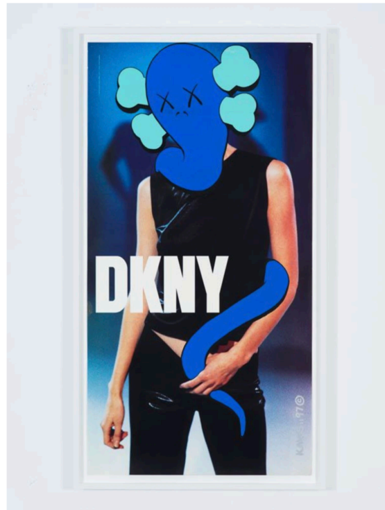
KAWS, "Untitled (DKNY)," 1997, a phone-booth ad that the artist appropriated.