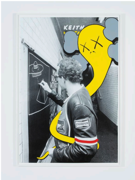
KAWS, "Untitled (Haring)," 1997, in which the artist took an existing image of Keith Haring and overpainted it.

One of the first pieces in "WHAT PARTY," from 1997, is its most instructive: an image of Keith Haring drawing on a subway ad as one of Donnelly's cartoon slugs coils around him, peering over his shoulder, as if taking notes. Haring, who shared graffiti writers' goal of maximum exposure, wanted to make his art as democratically accessible as possible, and did so mainly through public murals but also the Pop Shop, where he sold inexpensive reproductions and tchotchkes. KAWS's project is effectively Haring's pushed to delirium.