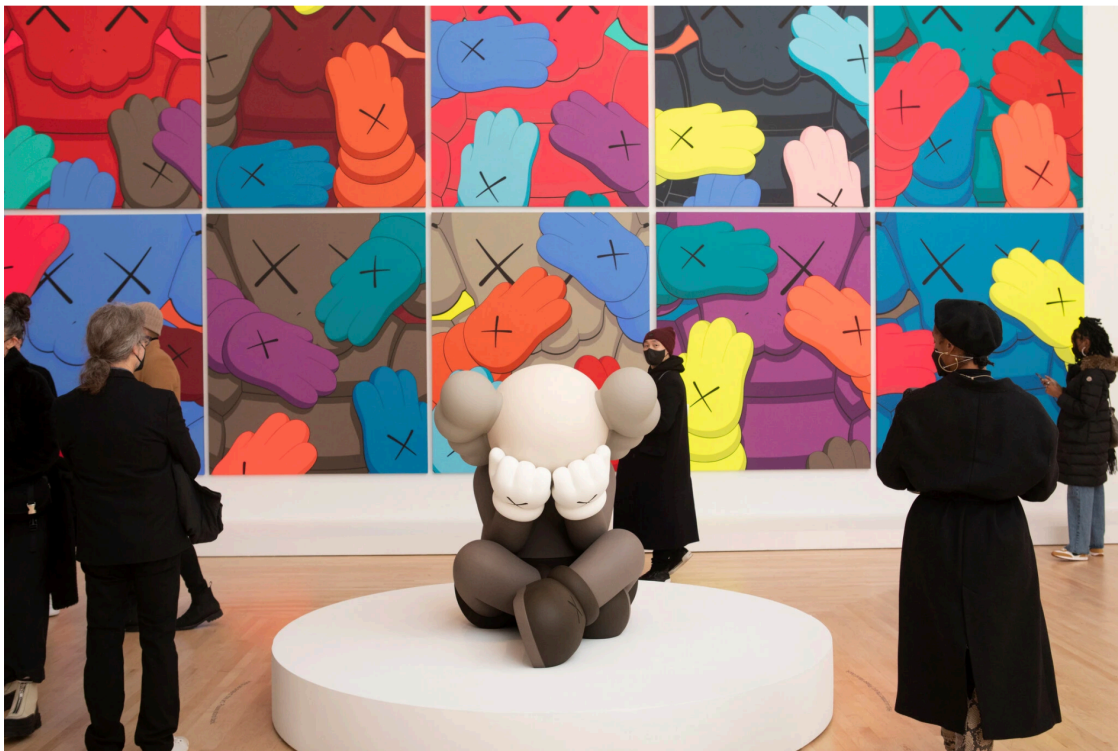
A preview of "KAWS:WHAT PARTY" at the Brooklyn Museum on Tuesday offered a room of new work by the artist Brian Donnelly related to the pandemic. The wall of images is from his "Urge" series; the despairing sculpture is titled "Separated."

The Simpsons, Snoopy and the Smurfs are all here in a survey of the artist Brian Donnelly's 25-year career.