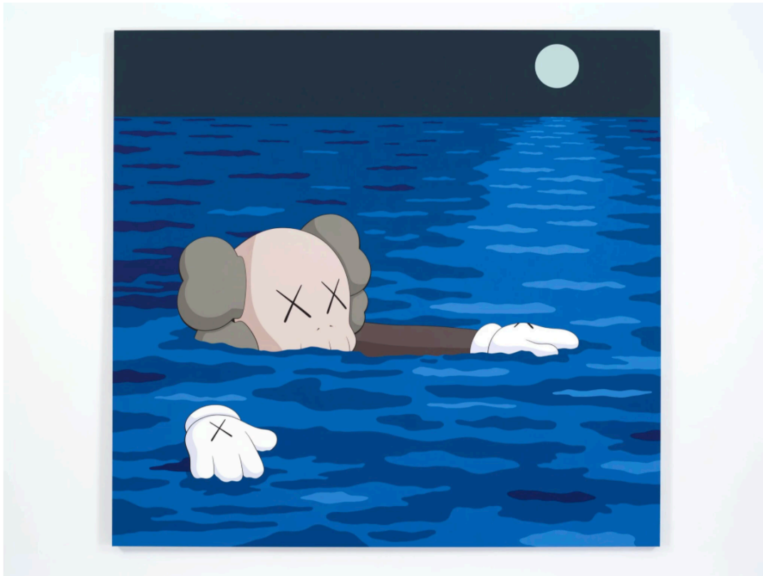
KAWS, "Tide," 2020. KAWS and Brooklyn Museum

There's also a room devoted to work made last year addressing the pandemic: "Urge," a suite of 10 roughly square canvases, disembodied hands dangerously close to touching a face; "Separated," a sculpture of a Companion figure, crumpled into a pile with its face in its hands; and "Tide," a painting of Companion adrift in a moonlit body of water, possibly drowning. The paintings are luminous, their rich pigment seeming to glow from within. But as a comment on the current moment, and its staggering loss, they feel mostly perfunctory. Their mood is morose but so is everything else.