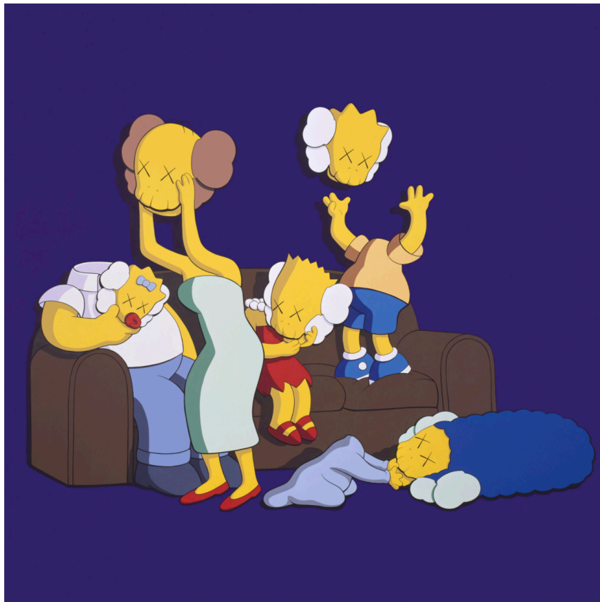
KAWS, "Untitled (Kimpsons #2)," 2004, acrylic on canvas.

Donnelly's "Simpsons" work is some of his most commercially successful and least altered from its source material, though Donnelly was not totally allergic to formalist experimentation: His "Landscape" series, made on canvas (2001), four examples of which are here, offers a single "Simpsons" character blown up and cropped so that its features resemble abstractions. They play with ideas of cool, calm Color Field painting and Hard-Edge, with its sharp, clear shapes, and especially recall Al Held's Alphabet Paintings of the '60s, which drew from advertising.